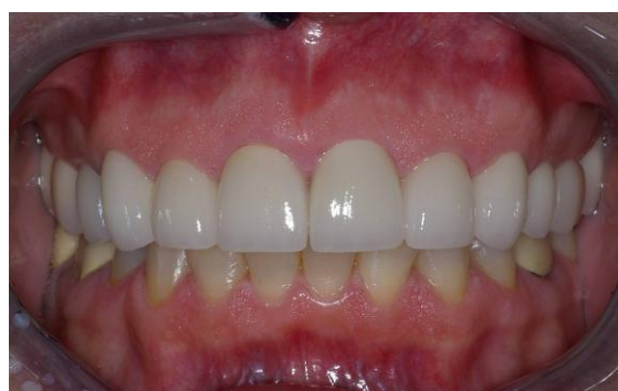
Figure 4 - Retracted post-operative view of cemented restorations.