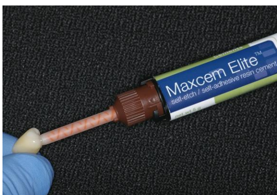
Figure 3 - Placement of Maxcem™ Elite into Lava crown.