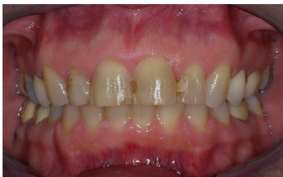
Figure 1 - Retracted before view of patient.

As dentists, we are always looking for something that is quick and simple to use yet very effective. Maxcem™ Elite is indeed an enhanced and better version of the traditional Maxcem™ cement; one of the first to introduce the self etch resin cements to the dental profession. Now with increased bond strengths and the ability to spot tack, Maxcem™ Elite will prove to be a new enhanced leader in the field.