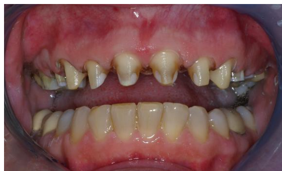
Figure 2 - Retracted view of preparations.